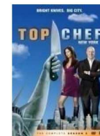
TOP CHEF: NEW YORK