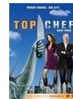
TOP CHEF: NEW YORK