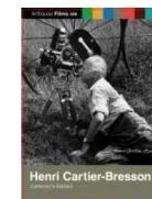
HENRI CARTIER- BRESSON COLLECTOR'S EDITION