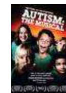
AUTISM: THE MUSICAL

Distributed in the U.S. by New Video 902 Broadway, 9th fl, New York, NY 10010 Tel: (212) 206-8600 E-mail: info@newvideo.com