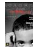
THE FIRST YEAR