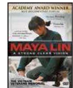
MAYA LIN: A STRONG CLEAR VISION

Distributed in the U.S. by New Video 902 Broadway, 9th fl, New York, NY 10010 Tel: (212) 206-8600 E-mail: info@newvideo.com