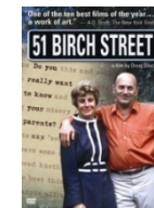
51 BIRCH STREET