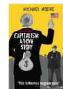
CAPITALISM: A LOVE STORY