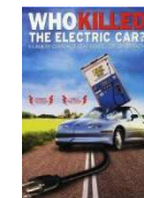
WHO KILLED THE ELECTRIC CAR?