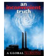
AN INCONVENIENT TRUTH

NEWVIDEO DISTRIBUTED IN THE U.S. BY NEW VIDEO, 902 BROADWAY, 9TH FL. NEW YORK, NY 10010 newvideo.com