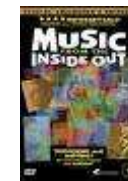
MUSIC FROM THE INSIDE OUT