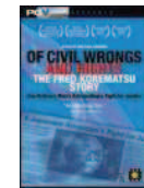
OF CIVIL WRONGS & RIGHTS

DISTRIBUTED BY NEWVIDEO Distributed in the U.S. by New Video, 902 Broadway, 9th Fl New York, NY 10010 newvideo.com